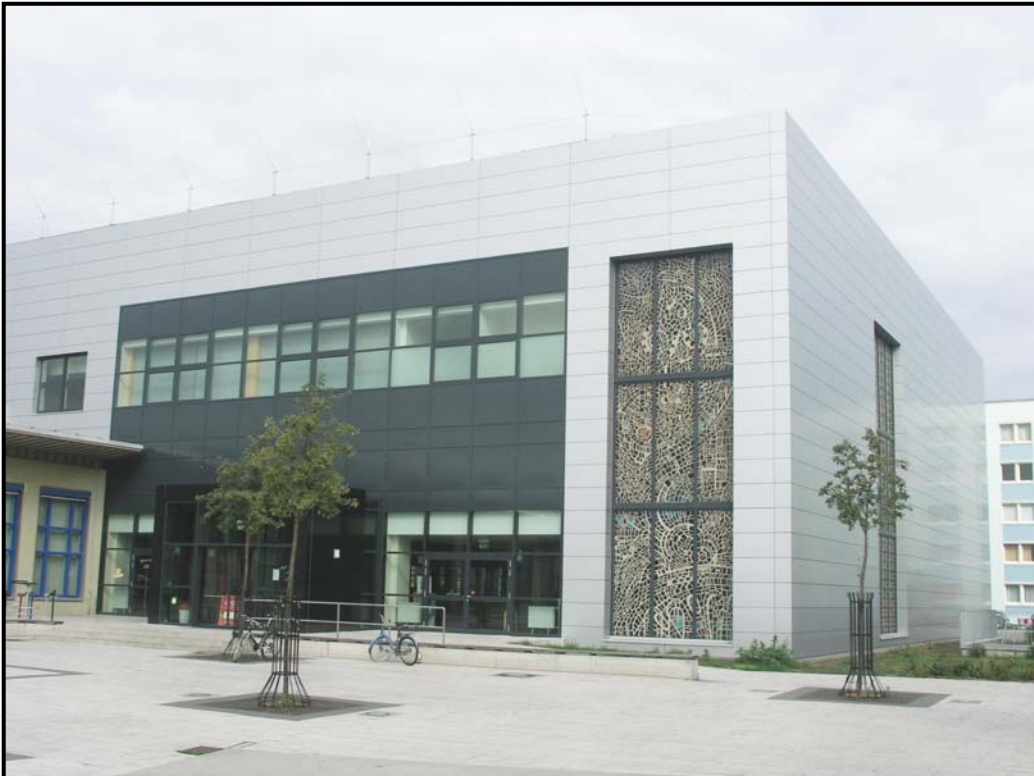
Main Cafeteria (Mensa) on campus (building 27)

On campus, there are several facilities for students to get a meal or to have a snack: