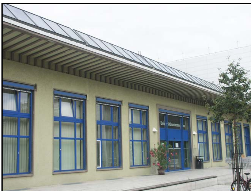
The University Computer Centre, building 26