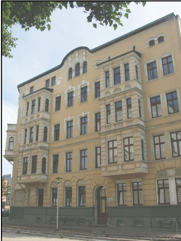
Building 06 on Magdeburg University campus

The enrolment should be done in the Department of Academic Affairs, students' office, building 06, side entrance, room 08, at Ms Lapp's office.