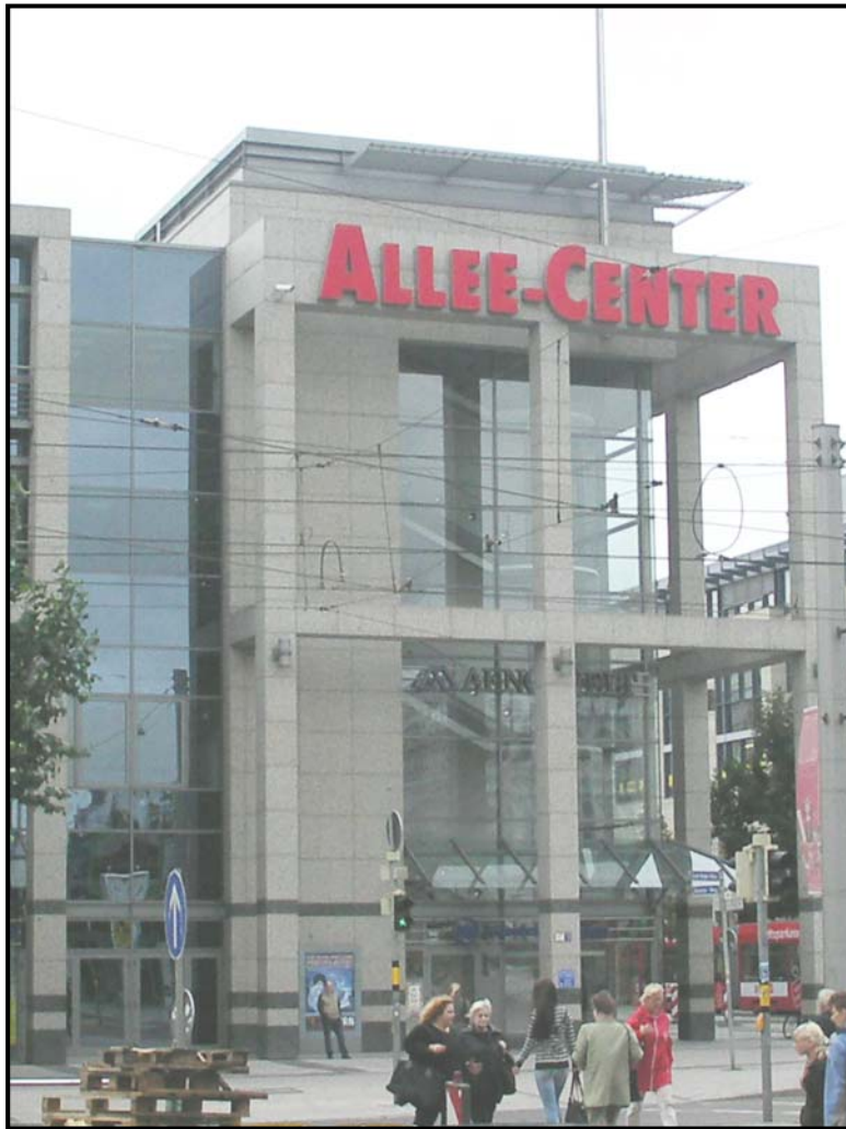
The Allee-Center at Ernst-Reuter-Allee

City-Carré and Allee-Center are two huge shopping centers where you can discover numerous shops.