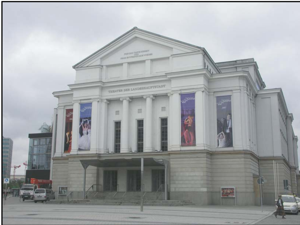
The Theatre of Magdeburg (Universitätsplatz)

The theatre is centrally located and easily accessible at Universitätsplatz. It offers a wide range of operas, operettas, dramas, ballets, philharmonic concerts and contemporary stage performances. There are also numerous small events and open air performances during the summer.