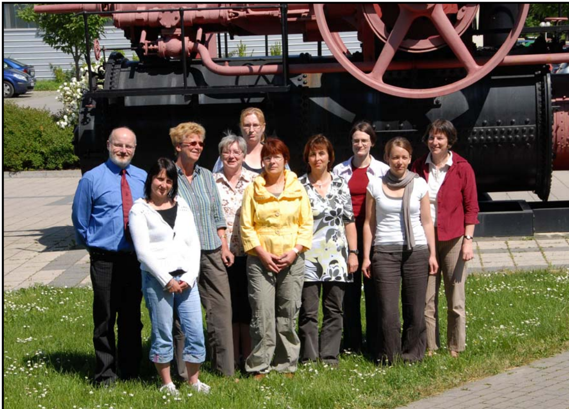
Die Mitarbeiter des Akademischen Auslandsamtes

In addition, the International Office offers many services for students after their arrival in Magdeburg and during their studies here. In co-operation with the student group IKUS, they arrange for support and care for the newly arrived students. They assist foreign students in their contact with the public authorities, and are always ready to help if a problem should occur.