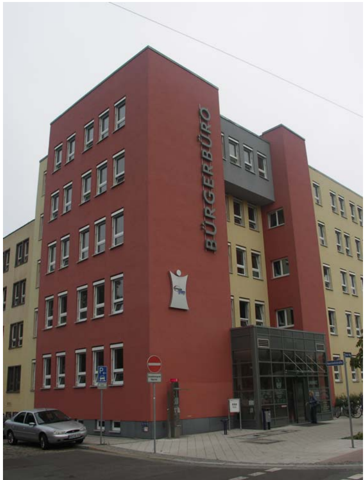
Bürgerbüro Mitte on Breiter Weg

If you move within Germany (even within the dormitory), you must inform the resident registration office about your new address. If moving within Germany, the official notification at the old place of residence is not necessary.