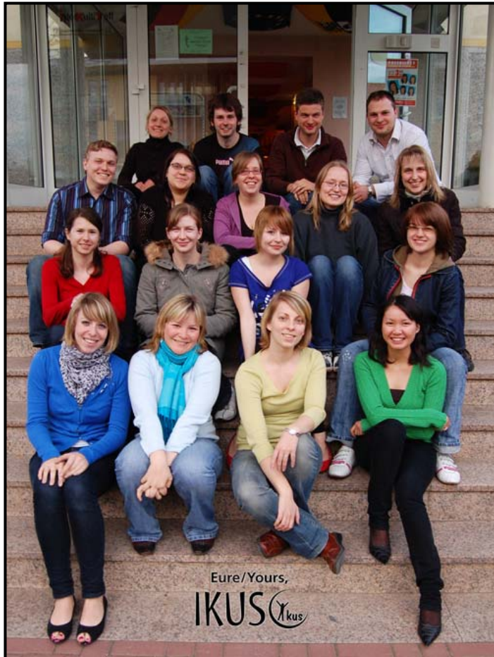
The student group "IKUS"

In addition to the practical assistance of new students, the IKUS also try to facilitate contact between German and foreign students. With this goal, they arrange discos, dinner parties, excursions, and other activities throughout the semester. These arrangements are open to all students.