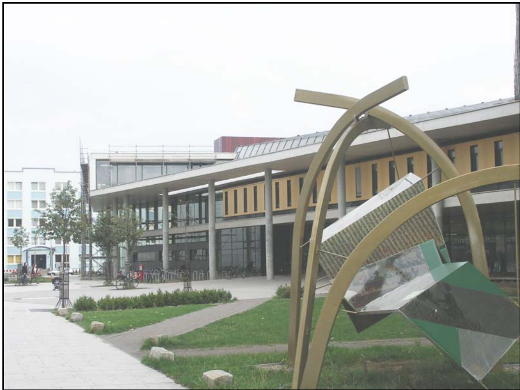
Front view of the University Library (Building 30)

If you want to become a user of the University Library, you have to bring your passport, your certificate of enrollment and your tenancy agreement for registration.