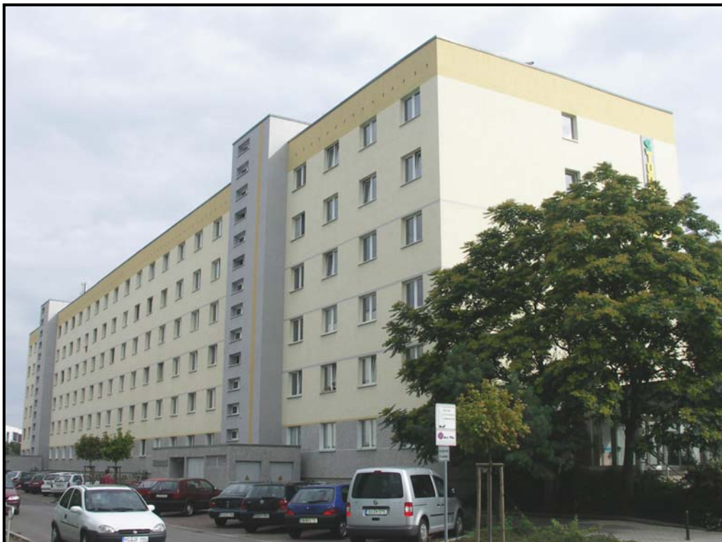
Dormitory 11, Walther-Rathenau-Straße 19