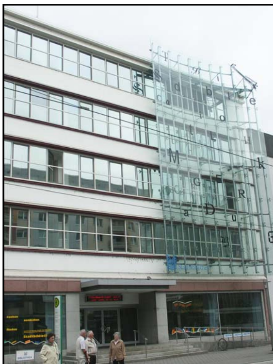
The Central Library Breiter Weg

The City Library (Stadtbibliothek) is a public facility of the city of Magdeburg with a diverse offer.